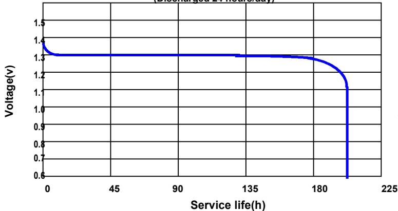
DISCHARGE CHARACTERISTICS AT 1500Ω 20°C 60%RH (Discharged 24 hours/day)